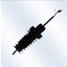
Cable support hanger