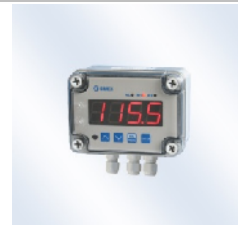
Wall mounted digital indicator

Visit the website: www.impress-sensors.co.uk