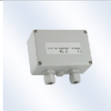
Cable Terminal Box with Vent